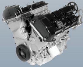
$450 INCENTIVE FORD DIESEL ENGINES